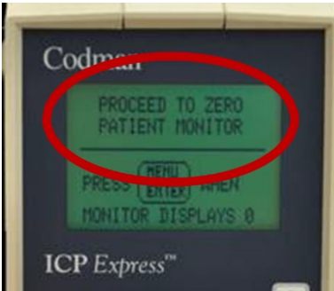
Figure 3: Step One. Proceed to the bedside monitor will display - iff this option does not appear, select the WHITE “zero patient monitor” option to send a 0 mmHg signal to the bedside monitor.

4. Rezero the bedside monitor as shown in the steps below: