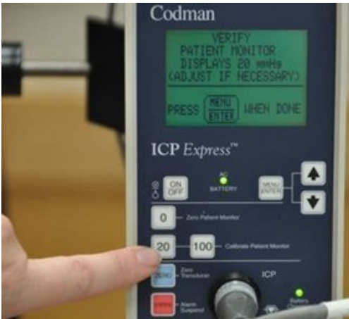
Figure 5: Step Three. When prompted, select “20” on the Codman Express™. This sends a calibration pressure of 20 mmHg to the bedside monitor.