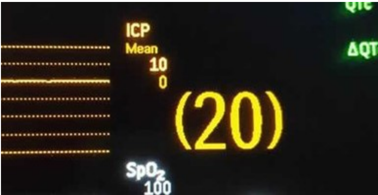
Figure 6: Step Four. Confirm that the Philips™ monitor is displaying an ICP of 20 mmHg. This can take several minutes. If it does not confirm 20 mmHg, repeat until 20 mmHg is displayed and the isoelectric line corresponds to a pressure of 20 mmHg.

Remember – we send the pressure to the Philips™ monitor to produce a waveform. The pressure is measured by the Codman Express™ and the Philips™ is a “copy”. If there is a difference between the Codman Express™ pressure and the Philips™, the Codman Express™ is the source of truth. There must be a problem between the Philips™ cable, module or zeroing/calibrating of the monitor.