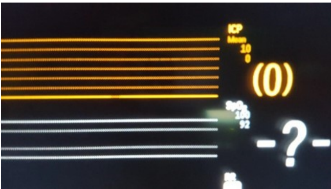
Figure 4: Step Two. Confirm that the bedside monitor displays a pressure of zero and shows an isoelectric line along the zero scale. If it does not, repeat the zeroing steps selecting the WHITE “zero patient monitor” option, then zero the Philips™ monitor.

When Proceed to Zero Patient Monitor is displayed, select the zero option on the PHILIPS™ monitor for the ICP module. You do not need to position any part of the monitoring circuit level to zero the Philips™ monitor to the Codman Express™ The Codman Express™ sends a pressure of zero to the Philips monitor for confirmation.