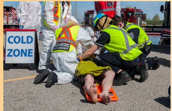
Treatment on Scene