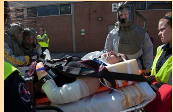
Transfer of Care